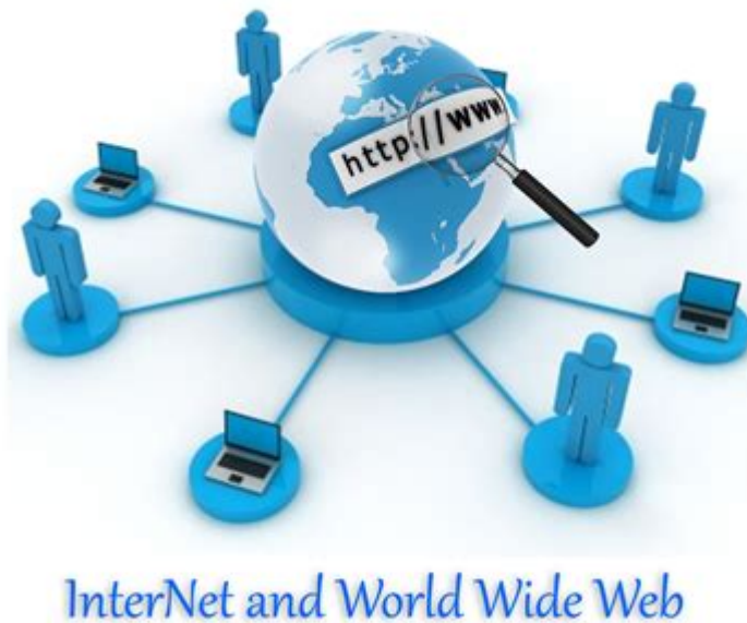
InterNet and World Wide Web

For more serialized content, explore platforms like Wattpad, Royal Road, and Archive of Our Own (Ao3). While these also host fan fiction, many original web novels and serials gain massive followings. Use their robust tagging and filtering systems to narrow down genres, themes, and tropes that align with your favorites.